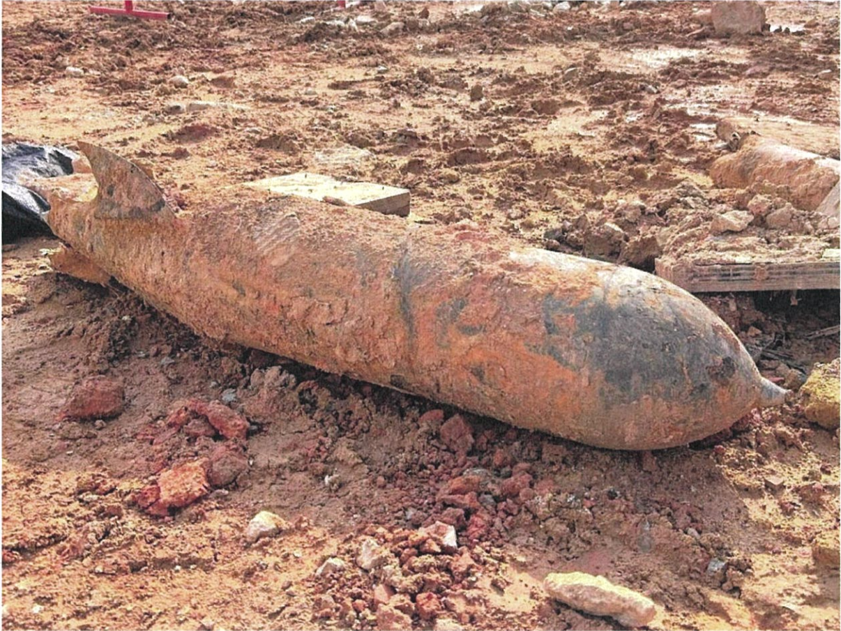
Image of the war relic to be disposed

11 The Police are working closely with the relevant authorities and the SAF EOD officers to ensure that the controlled disposal of the war relic will be carried out safely. Members of the public should cooperate with police officers deployed on the ground.