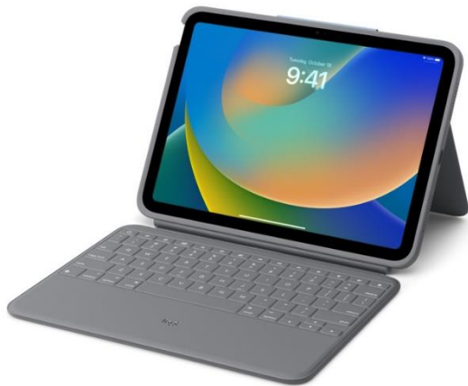
Apple iPad 10.9" 10th Gen $853.40