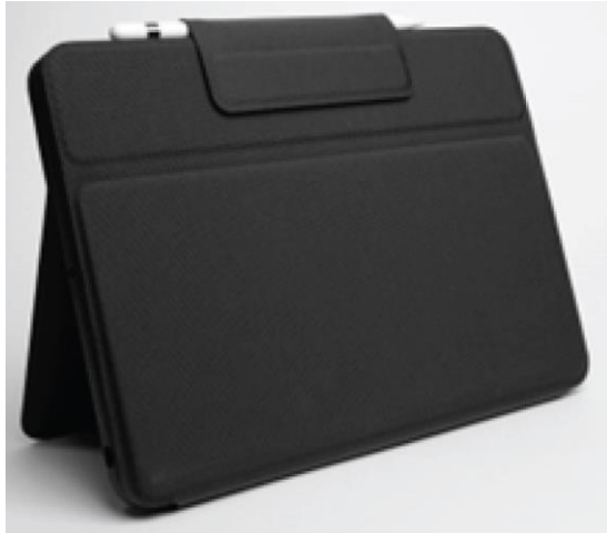
Apple iPad 10.9" 10th Gen

The school will be using the Apple iPad 10.9" 10th Gen for teaching and learning.