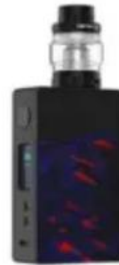
large-size tank devices